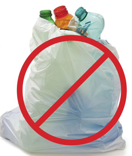
Don't Bag Recyclables - Place items directly in recycling container.

Due to global changes in the recycling industry and commodity markets, collecting quality recyclable materials is more important than ever. Waste Management needs your help to reduce recycling contamination. To launch this initiative, we are focusing on one of the biggest contaminants – bagged recyclables. We are asking customers to "LOOSE LOAD" their recycling.